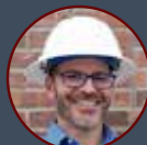
Aaron Daler Design & Construction