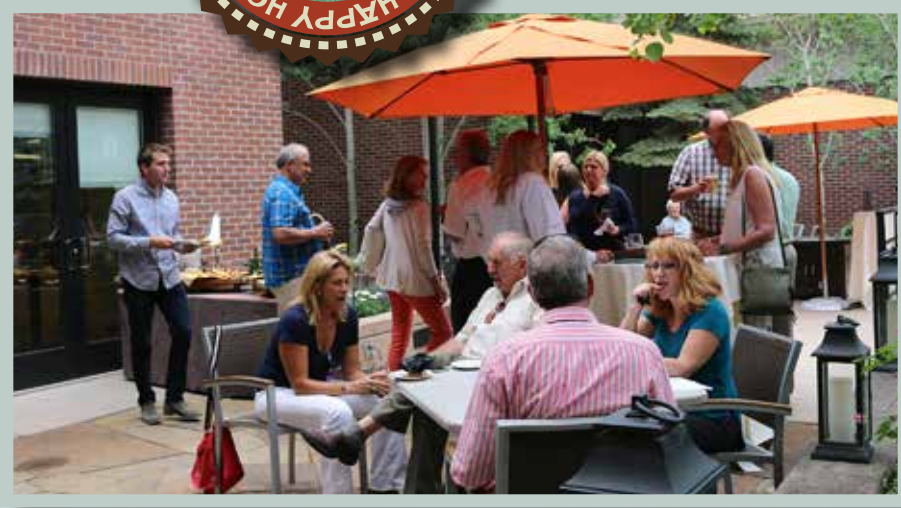
ABOR Members enjoy one of the first summer nights @ happy hour.